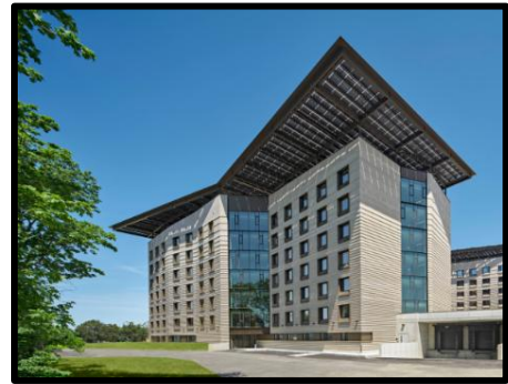
Figure 1: The newly opened Community Living Center in Chelsea

Veterans Homes in Chelsea and Holyoke provide essential long-term care and foster community for those who served. The FY26 House 1 budget recommendation includes $46.5 million for the Chelsea Home and $33.3 million for the Holyoke Home, resources that will be key in supporting the costs of staffing and care. Further, EOVS continues to utilize an additional $25.4 million in federal ARPA funds to increase veterans' access to housing, economic development in the form of job development and retraining programs, and expanding veterans' access to essential services.