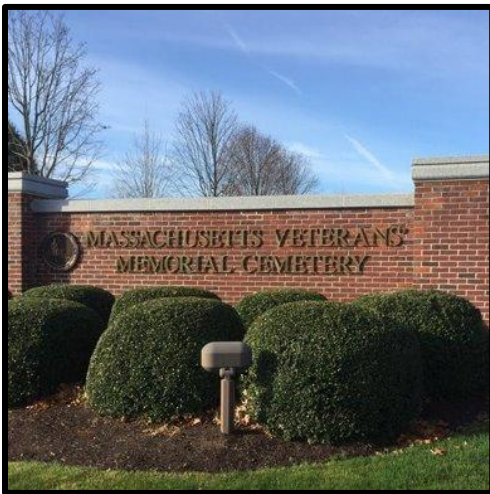
Figure 2: Entrance of the Agawam Veteran Cemetery.

Both Homes are undergoing transformations to replace outdated facilities with modern, community-focused centers, funded through the Commonwealth's Capital Investment Plan (CIP) and federal contributions. The CIP also includes $163.9 million over four fiscal years (FY25-FY29) for continued support of Community Living Centers (CLCs) in both Chelsea and Holyoke.