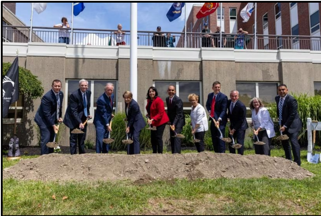
Figure 3: Breaking ground on the new Holyoke long-term care facility

In August 2023, Holyoke broke ground on its new long-term care facility, which is expected to open in Fall 2028. This project will construct a new 350,000 sq. ft. long-term healthcare facility for 234 veterans that will replace the existing Holyoke Veterans Home. The new facility will include gardens, physical therapy facilities, a dental suite, hair salon, dining and social spaces, and the replacement of the existing site infrastructure.