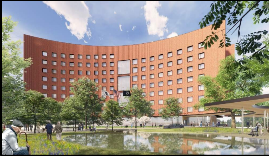
Figure 4 :The new Veterans Home in Holyoke's long-term care facility, scheduled to open Fall 2028