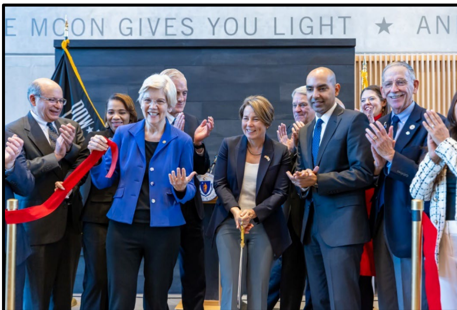
Figure 2: US Senator Elizabeth Warren, Governor Maura Healey, and Veterans' Secretary Jon Santiago participate in the ribbon cutting ceremony at the new Veterans Home in Chelsea's long-term care facility

In October 2023, Chelsea opened its new long-term care facility, which replaced the 136-bed Quigley Building. The $200 million new long-term care facility has received funding in the Capital Investment Plan for the past several years and is partially reimbursed by the U.S. Department of Veterans Affairs. The new facility allows Chelsea to increase its long-term care capacity, which includes skilled nursing beds, long-term care beds, and dementia units. The new facility is roughly 80,000 square feet larger than the ward-style Quigley Building.